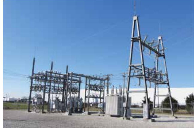
Substations, like the Asahi substation, can be found across South Kentucky RECC's service territory.

It is also important to teach children the dangers of substations. Children should be warned never to enter an electric substation for any reason—even on a dare or to attempt to retrieve a pet, ball or any toy from these areas. Call South Kentucky RECC for assistance.