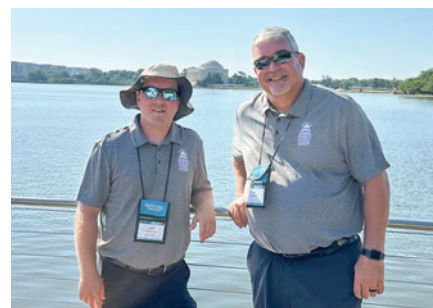
SOUTH KENTUCKY RECC STUDENT